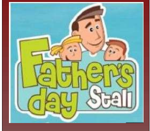
Room 3 Fundraiser